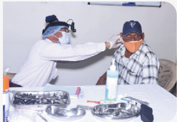
Medical Camp in Munnar (left) & in Ponda (right)