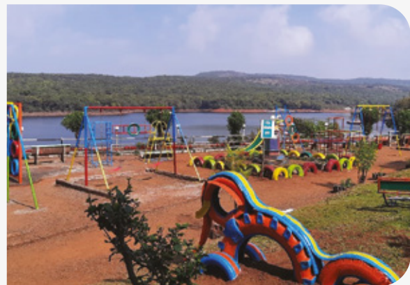
Recycled benches installed and installation of playscape in Mahabaleshwar