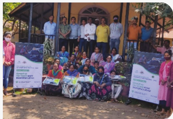
Safety gears distribution in Mussoorie (left) & in Mahabaleshwar (right)