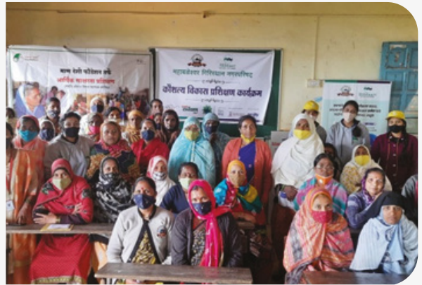
Capacity building training sessions in Ponda (left) & Mahabaleshwar (right)