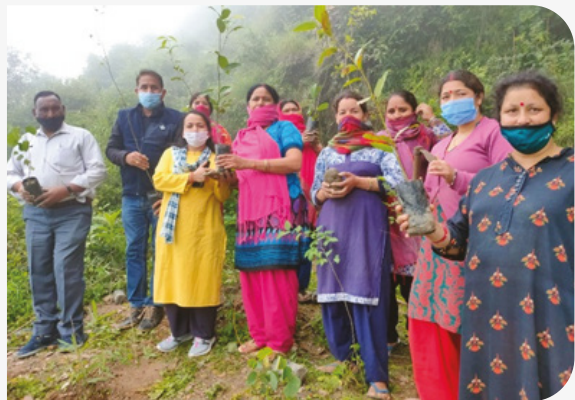
Sapling plantation in Mussoorie