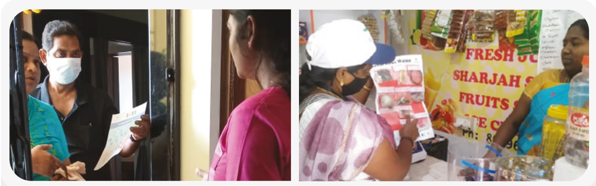
IEC Activities in Ponda (left) & in Munnar (right)