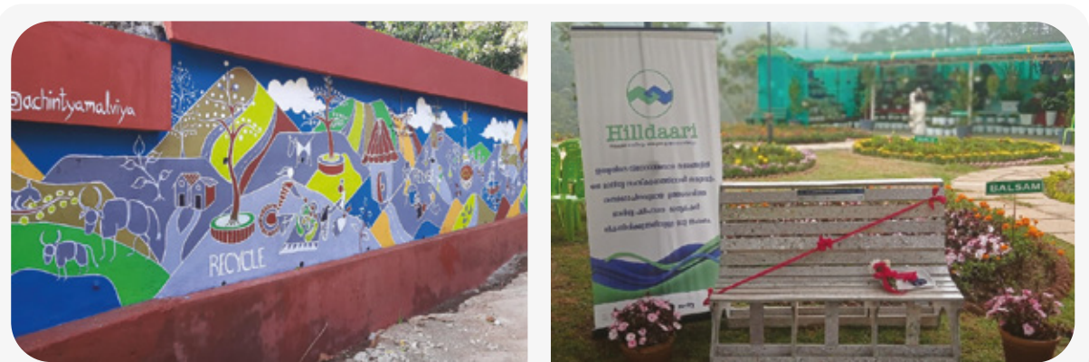
Wall mural in Mahabaleshwar (left) & Upcycled benches in Munnar (right)