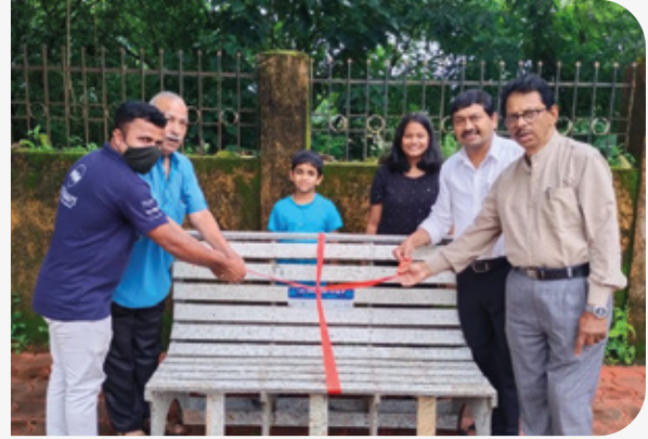
Dustbin installation in Nainital (left) & Upcycled benches installation in Ponda (right)