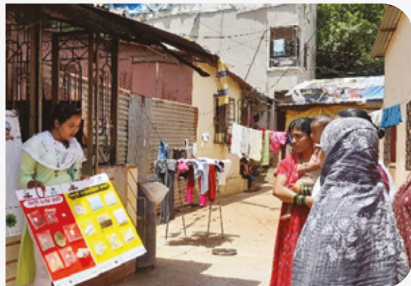
IEC Activities in Mussoorie (left) & in Mahabaleshwar (right)